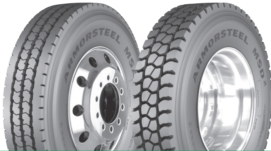
Armorsteel® MSD®2 M + S

DURABLE STEER/ALL-POSITION AND DRIVE TIRES FOR ON/OFF ROAD TRACTION AND LONG MILES TO REMOVAL